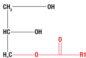
Figure 1. Monoglyceride Chemical Representation in MaxSimil Fish Oils (R1 = fatty acid)

Unique structure: One fatty acid attached to a glycerol backbone provides two polar ends that attract water and a non-polar tail end (R1) that attracts fat, thus enabling self-emulsification of the Omega MonoPure formulas.